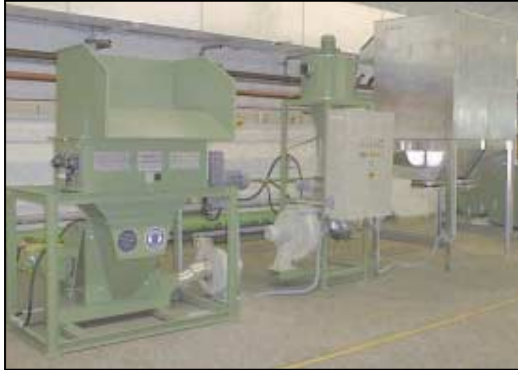
“Most of the EPS that is recycled comes from manufacturing assembly plants that receive components shipped in EPS protective packaging.”

There are three manufacturers of EPP. None supply a recycled content bead; therefore, the only way a molder of EPP can incorporate recycled content is to take in and grind used EPP products back to the bead level.