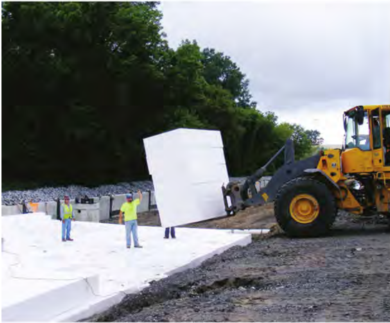
EPS can offer myriad benefits when used in geofoam applications.