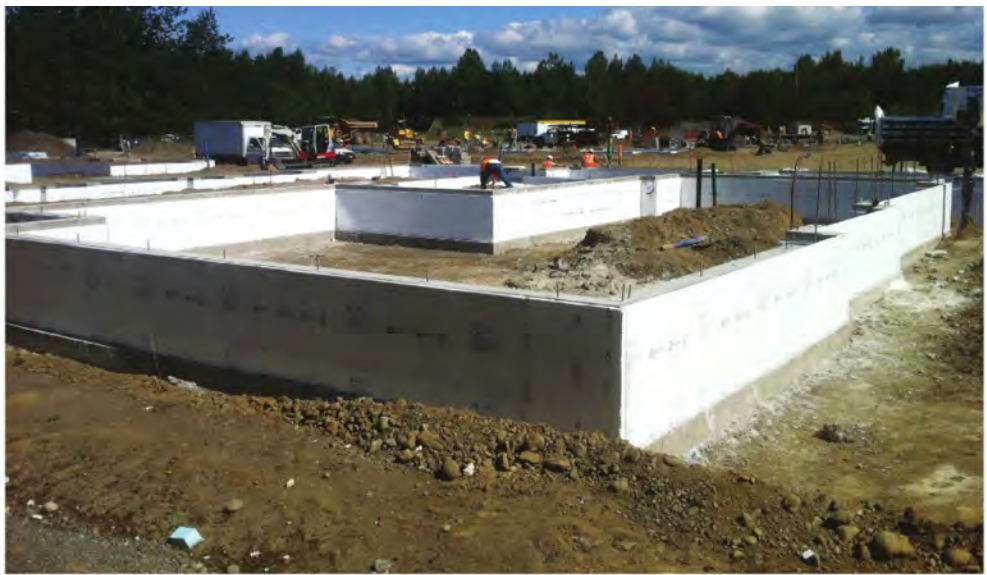
Rigid foam insulation can be used on both the exterior and interior of below-grade foundation walls.