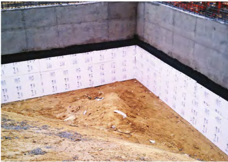
A foam insulation layer protects waterproofing on foundation walls during backfill.