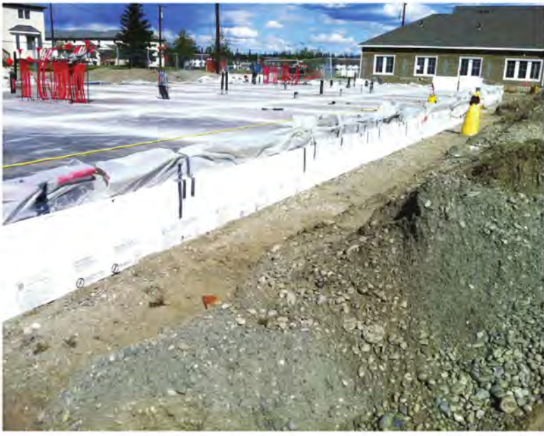
Below-grade insulation enhances thermal performance in buildings, while also helping to protect concrete from freeze-thaw damage.

and XPS removed from a side-by-side installation after 15 years in service on a below-grade foundation in St. Paul, Minnesota. As summarized in Figure 1, the XPS was significantly wetter on extraction, with 18.9 percent moisture content by volume compared to 4.8 percent for the EPS. Further, after 30 days of ‘drying’ (to simulate practical temperature swings), the XPS still had elevated moisture of 15.7 percent, while the EPS had dried to 0.7 percent.