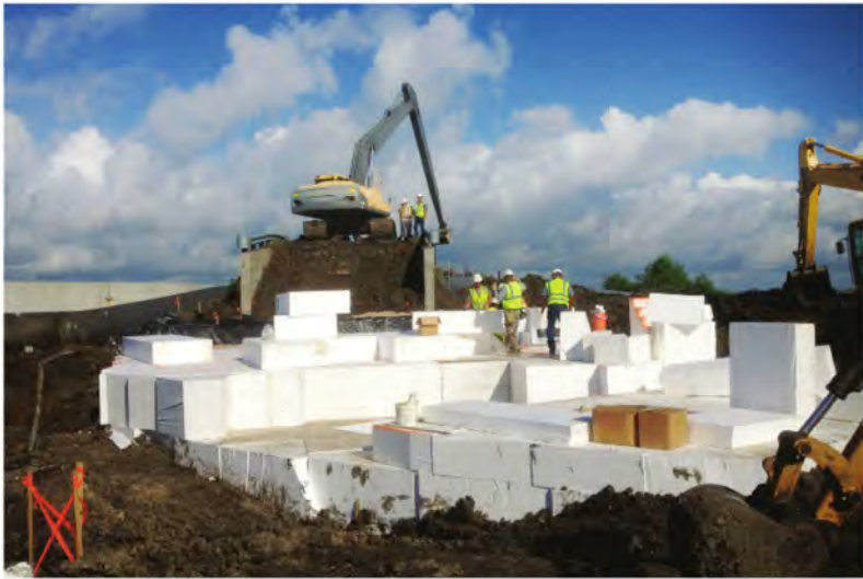
The compressive resistance of EPS is demonstrated in its frequent use as geofoam in demanding structural void fill applications.

cellular structure over the product's life, thereby reducing its thermal performance with each day in the field. Thermal stability also gives EPS its ability to retain R-value through years of freeze-thaw cycling.