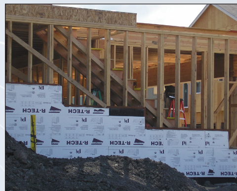
Below Grade Application