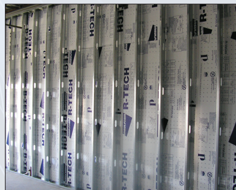
Interior Wall Application