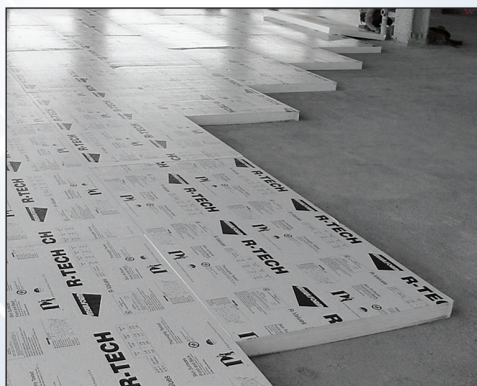
Under Slab Insulation Application